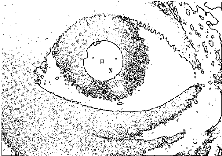
FIG. 3. Single frame (200 msec.) from the film record of a monkey after training to fixate "8" and avoid fixating "3." Note that the pupil encircles the "8."

The film negative was enlarged by a factor of 32 with a Reichert Visopan microscope. Readings were made on each frame by locating the center of the pupil and the left upper corner of the displayed image with one arm of a pantograph. A light sensitive pen was mounted on the other arm of the pantograph and positioned in front of an oscilloscope screen which displayed a computer driven roster display. Upon activation of the light sensitive pen with a foot pedal the coordinates on the roster display were recorded by the laboratory PDP-8 computer. The computer then transformed these into column-row coordinates of the actual display matrix. Preliminary computer analysis of these individual frame readings provided actual and proportional totals of visual fixations for each 2\frac{1}{2} \times 2\frac{1}{2} -in. area of the 10 \times 10 -in. display (a 4 \times 4 analysis). Raw data were saved on magnetic tape for more detailed analysis.