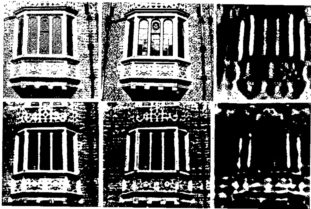
Figure 3: A reconstruction of a picture by computer using lines only (right upper), lines and corner (right lower), and various bands of frequency (the four figures on the left). Note the marked improvement in resolution and detail when reconstruction is by the spatial frequency method.